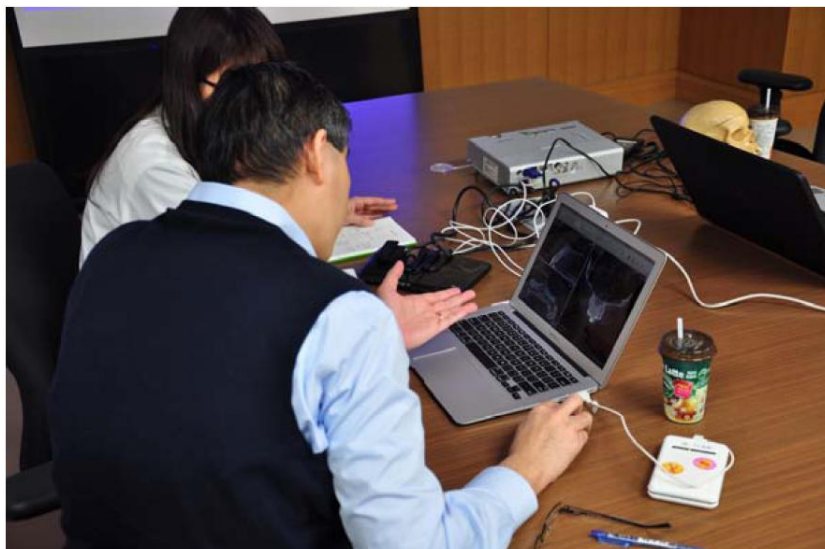
Assessing feasibility of OsiriX software as a visualization and measuring tool.

These discussions succeeded in defining the parameters for study and to define the possible references planes that could be used when measuring these parameters. Methodology for measurement was also established In short, the purpose and objectives of this research trip were achieved admirably.